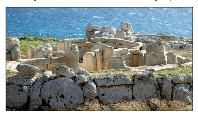
Day 6 - September 22: Villages and Shrines/ Istanbul

After breakfast, we visit the typical fishing village of Marsaxlokk, and continue on to the Neolithic temples of Hagar Qim and Mnjadra, UNESCO World Heritage Sites. After lunch on our own, we will drive to the Shrine of the Redeemer in Senglea for Mass. We continue with a guided tour through the cave of Ghar Dalam before returning to our hotel for dinner and overnight. (B,D)